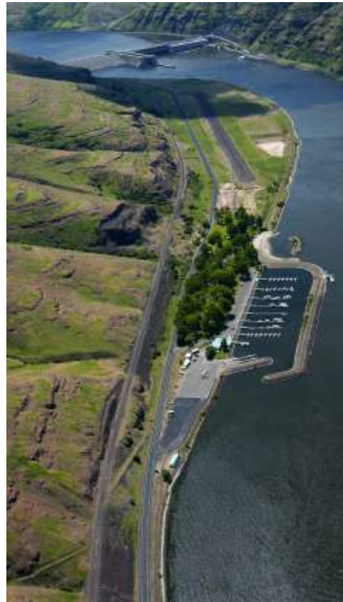
Above: Boyer Park & Marina

In 1995, two grants were written and awarded to the Port for the enhancement of Boyer Park and Marina. The first, an IAC (Interagency Committee for Outdoor Recreation) grant, provided for the main boat launch parking expansion, extensions for the boat launch, path paving within the park and on the jetty, a large picnic shelter at the restaurant building, 4 motel rooms, 2 new indoor restrooms, a new finger dock in the marina and a new cruise boat dock off the jetty. This work was started in 1996 and completed in 1998. The second grant, an ALEA (Aquatic Land Enhancement Account) grant from the Washington State Department of Transportation was also written in 1995. This grant funded the construction of the