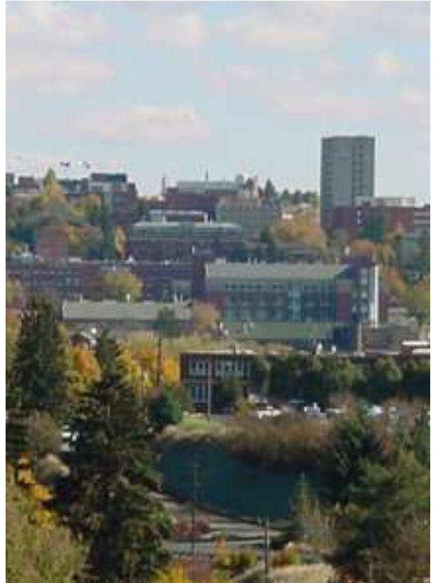
Above: View of Washington State University Campus

The Port of Whitman County is dedicated to improving the quality of life for all citizens of Whitman County through industrial real estate development, preservation of multi-modal transportation, facilitation of economic development and provision of on-water recreational opportunities.