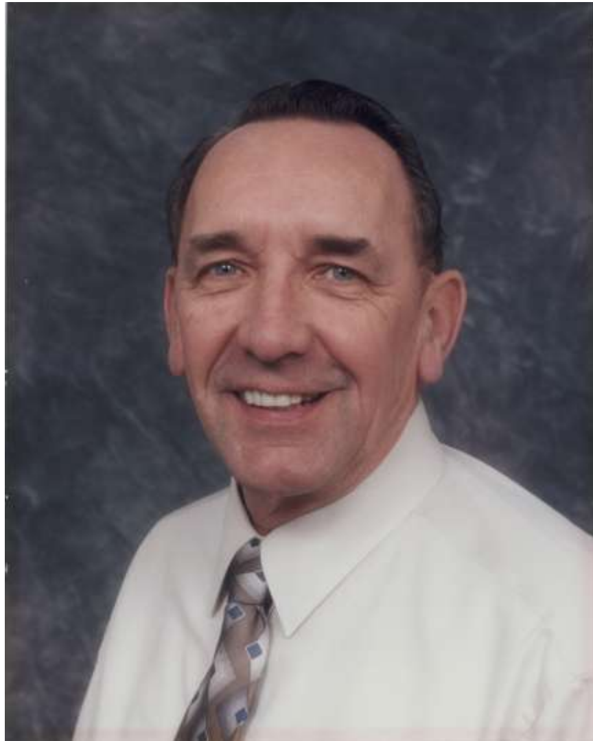
Port Commissioner, District 3 1998-2010